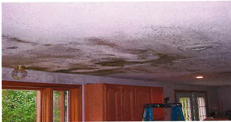
Water damage to main floor ceiling