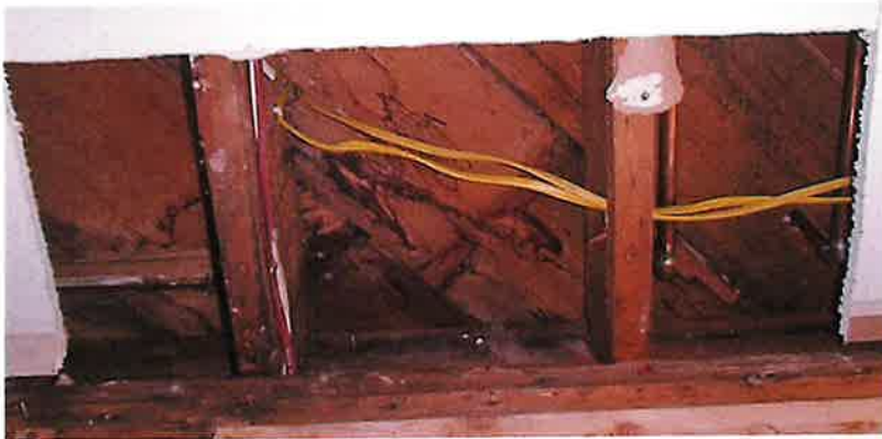
Water damage to main floor