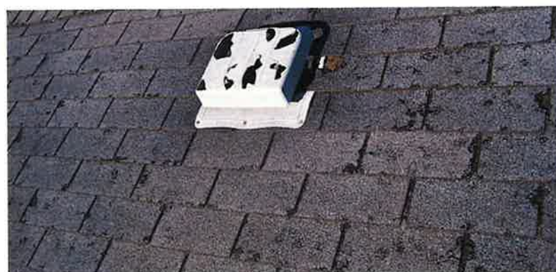
Roof needs to be replaced