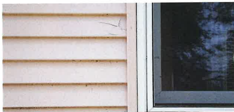
Cracked exterior siding